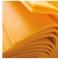
SLICE OVER SLICE