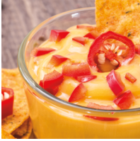
DIPS & SPREADS